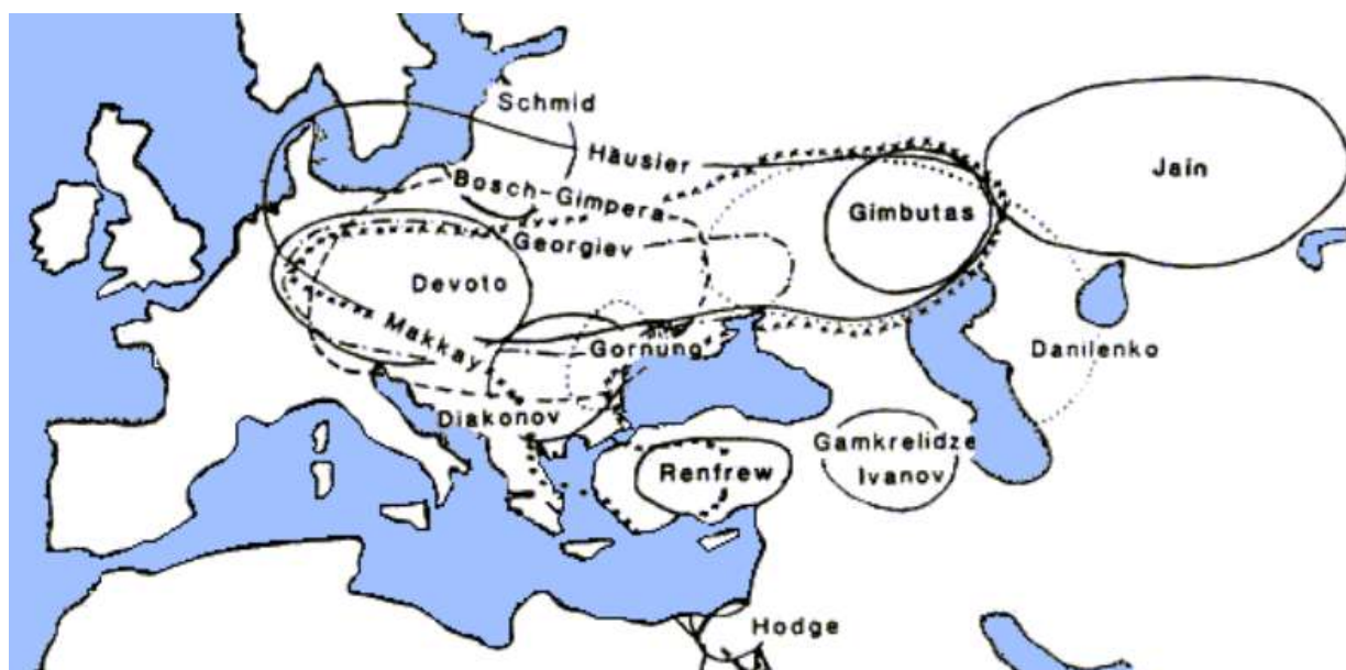
Fig. 1. The dozen of latest options of Indo-European languages cradle placement (this map is presented in many articles, Wikipedia and other sources) (Url: http://tied.verbix.com/project/chron/chron.html )

In fig. 1 is part of the best achievements with regard to the location of the «PIE cradle» of those scholars who did not refer to the data of noohistory or DNA genealogy.